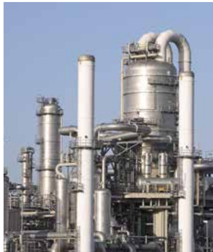
Refining, Petrochemical, Chemical and Utilities