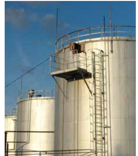
Exploration and Production