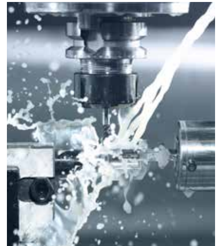
Manufacturing and Machine Tool